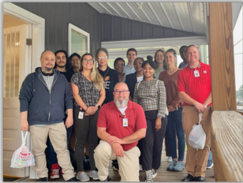
Attending the EJCAN Toxic Tour in Sampson County, September 2023