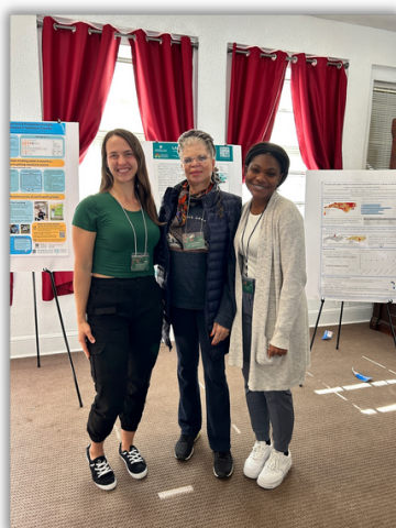
Learning from EJ Communities at the NCEJN Annual Environmental Justice Summit