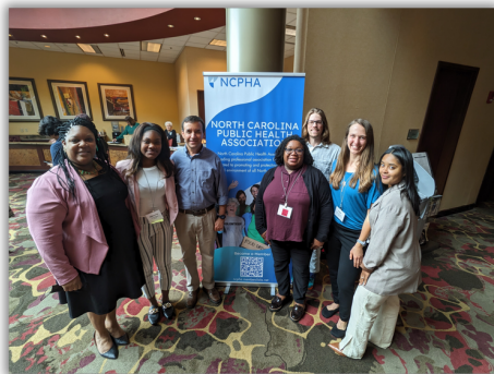
Bringing the Environmental Health Data Dashboard to the NCPHA Fall Educational Conference